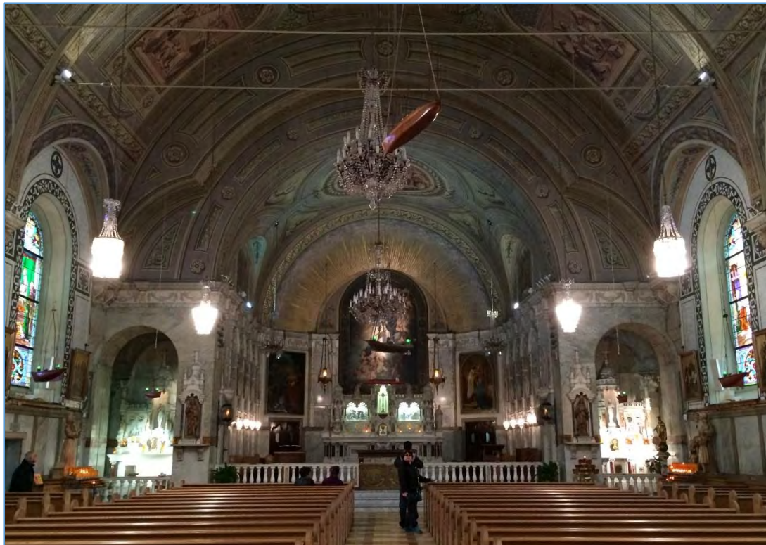
Notre-Dame-de-Bon-Secours Chapel completed in 1678. (re built in 1771)

Our next stop was Notre-Dame-de-Bon-Secours Chapel, the first stone chapel in the city of Montreal. This beautiful chapel is also known as The Sailors' Church and small sailing ships with votive candles hang from the ceiling to commemorate protection at sea by 'Our Lady of Good Help'. As it turned out, the chapel was open and an organ concert was about to begin in a few minutes. We were all in agreement to take the thirty minutes and absorb the beautiful sounds of Pachelbel, Telemann, and Bach. Unknown to us at the time a crisis that drew the attention of all Canadians was unfolding on Parliament Hill in Ottawa.