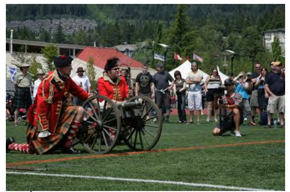
78<sup>th</sup> Highlander – Loyalist Friends