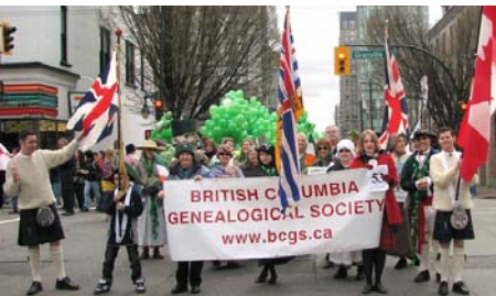
March 16<sup>th</sup>, 2008

Once again the Vancouver Branch UELAC participated in the St. Patrick's Day Parade along side the British Columbia Genealogical Society. It was a cool day in March but close to thirty people marched from these two groups, many in costume.