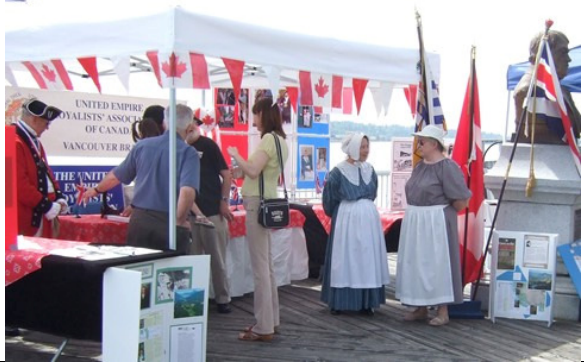
Our Branch is pleased to offer Colonial Period outfitting for sale. The clothing was once used in the television series "Hawkeye" (Partial List)

Sample prices below - Boy (B), Ladies (L) Men (M) Native