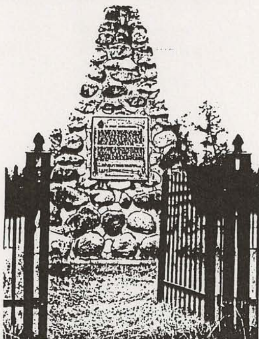
~ Inscription on Monument ~