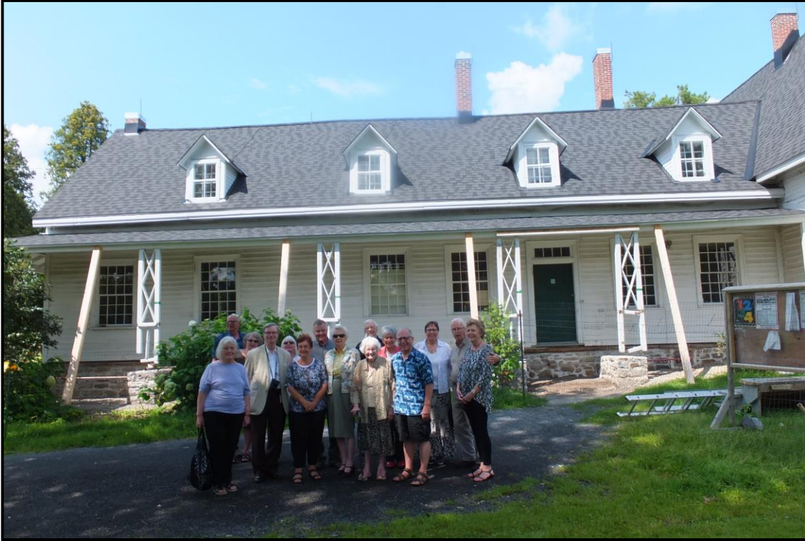
Members and guests in front of Sir John Johnson Manor House, under renovation.

After a delicious lunch at the museum, we visited the Sir John Johnson Manor House, the St. Mary's Catholic Church, the St. Andrew's United Church and the cemetery, and the Bethune Thompson House, all located in beautiful Williamstown, named after Sir William Johnson, father of Sir John Johnson.