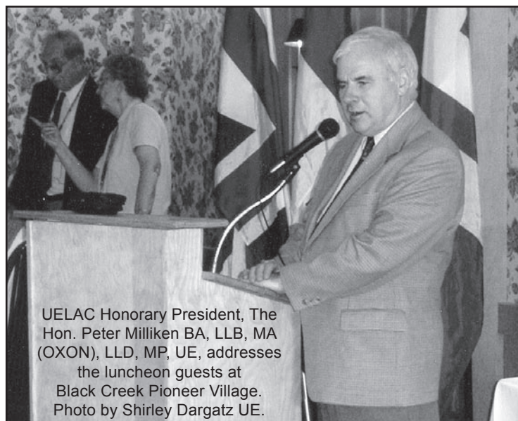
UELAC Honorary President, The Hon. Peter Milliken BA, LLB, MA (OXON), LLD, MP, UE, addresses the luncheon guests at Black Creek Pioneer Village.