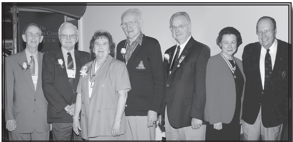
"...a long line of distinguished presidents"