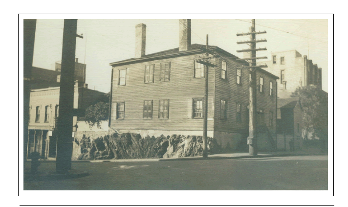
The Merritt House (Loyalist House), Union Street, Saint John, New Brunswick, 1934.

of United Empire Loyalists to our city, province, and country. The beautiful Georgian mansion is a showplace of the way of life of merchant class Loyalists circa 1833.