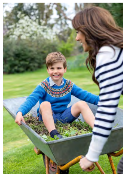
taken on the Windsor Estate earlier this month.

With the passing of the Queen last year he moved up to fourth.