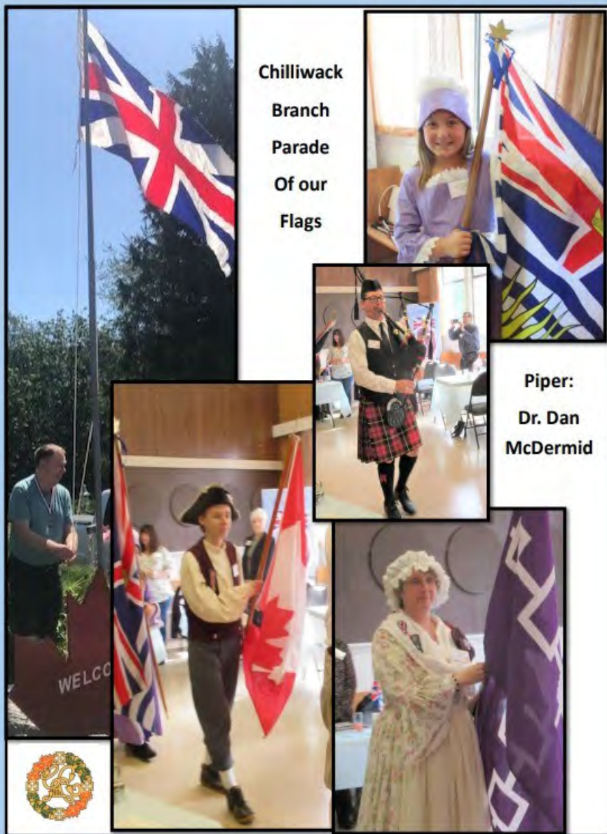
Chilliwack Branch Parade Of our Flags