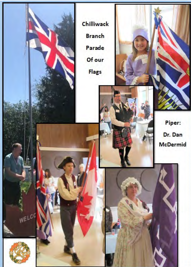
Chilliwack Branch Parade Of our Flags

Please go to pages 7 and 8, for the minutes together with the financial statement approved at the meeting. Thank you all for renewing your membership and for your continued support.