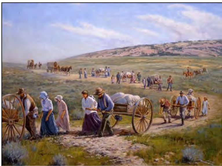
Pushing, Pulling and Praying: Bound for Zion by E. Kimball Warren