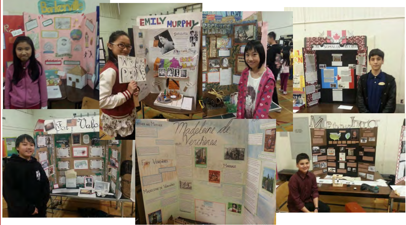
They know their Canadian History and are proud to show it. These are just a few of the competitors. Winners will be announced at a later date.