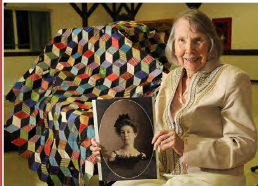
From the Chilliwack Progress Oct. 8th, 2013