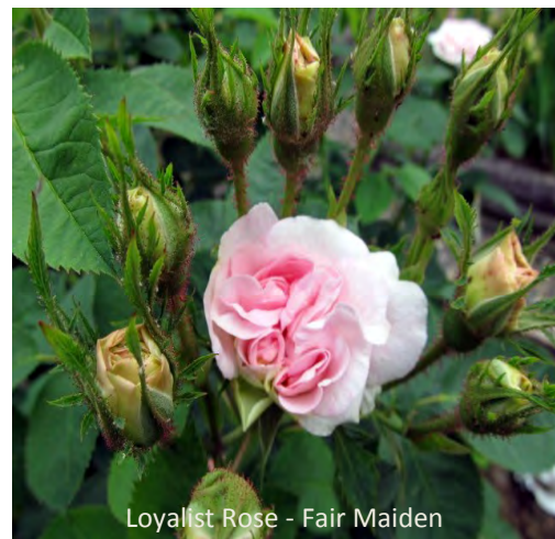
Loyalist Rose - Fair Maiden