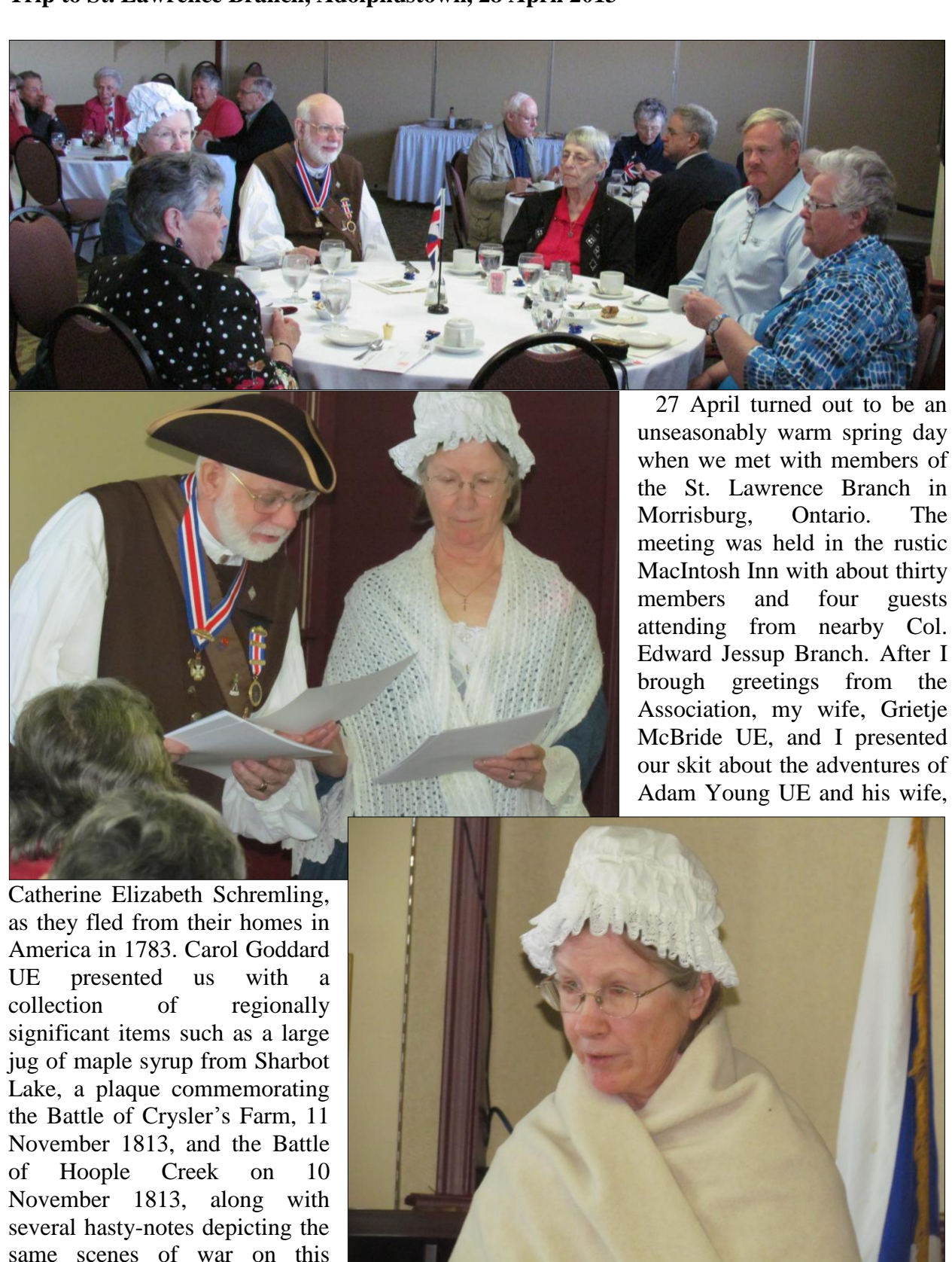
Trip to St. Lawrence Branch, Adolphustown, 28 April 2013