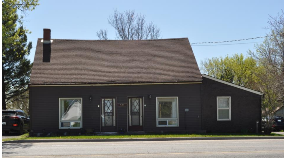
Kingston Whig-Standard, 27 Oct. 1937