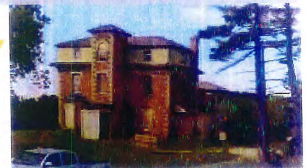
Photo of the class B heritage building.