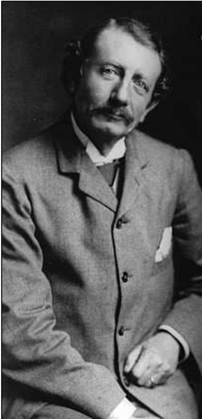
Hugh John Macdonald