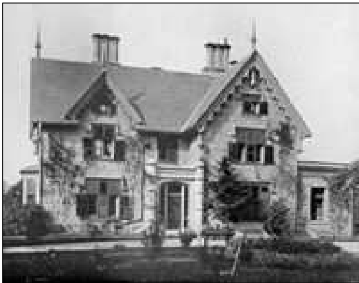
Earnscliffe – the Macdonald home - 1883 to 1891