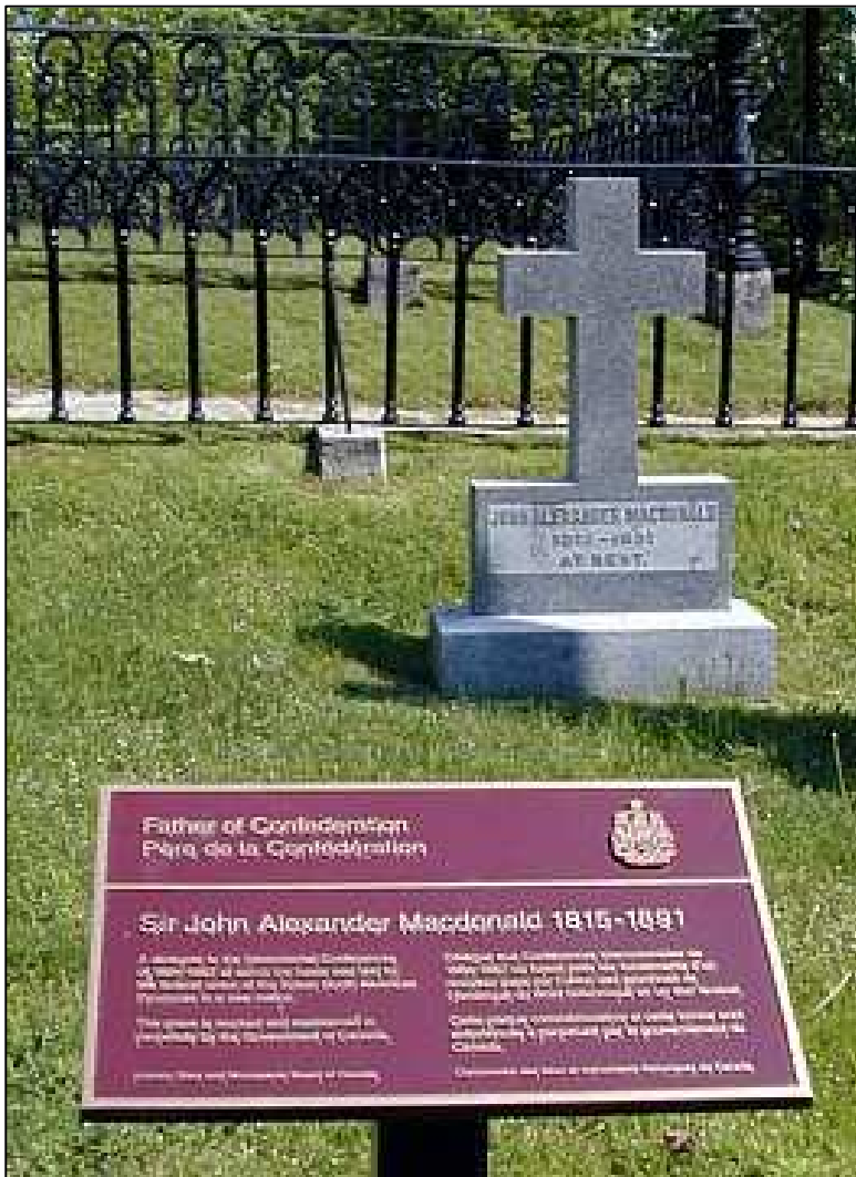
Sir John Alexander Macdonald's final resting place