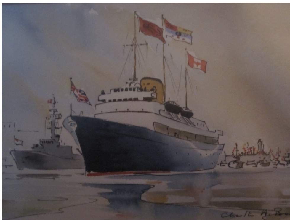
Britannia Arriving Victoria

The harbour hosted the royal yacht Britannia during the Queen's 1971 visit to celebrate BC's centenary.