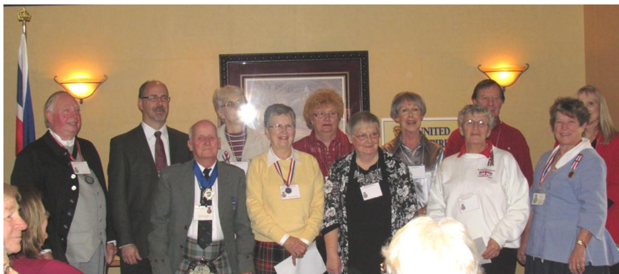
The Executive for 2012 were also sworn in at this luncheon.

Such enthusiasm and support encourages active members.