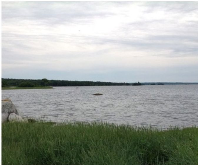
View of Shelburne Harbour from Birchtown

It is approximately a 15 minute drive southwest of Shelburne, Nova Scotia on Highway 3 to Birchtown. Settled in 1784 by Black Loyalists after the American Revolution, Birchtown became the largest settlement of free blacks outside of Africa. The historic site includes a National Historic Site of Canada monument, Saint Paul's Church, an old school house museum, a replica pithouse, a walking trail and park overlooking Shelburne Harbour as well as the Black Loyalist Centre opened on June 6, 2015. (1)