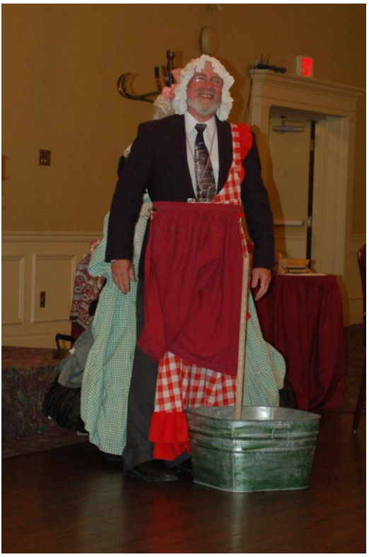
Did Pioneer Women have that many aprons?