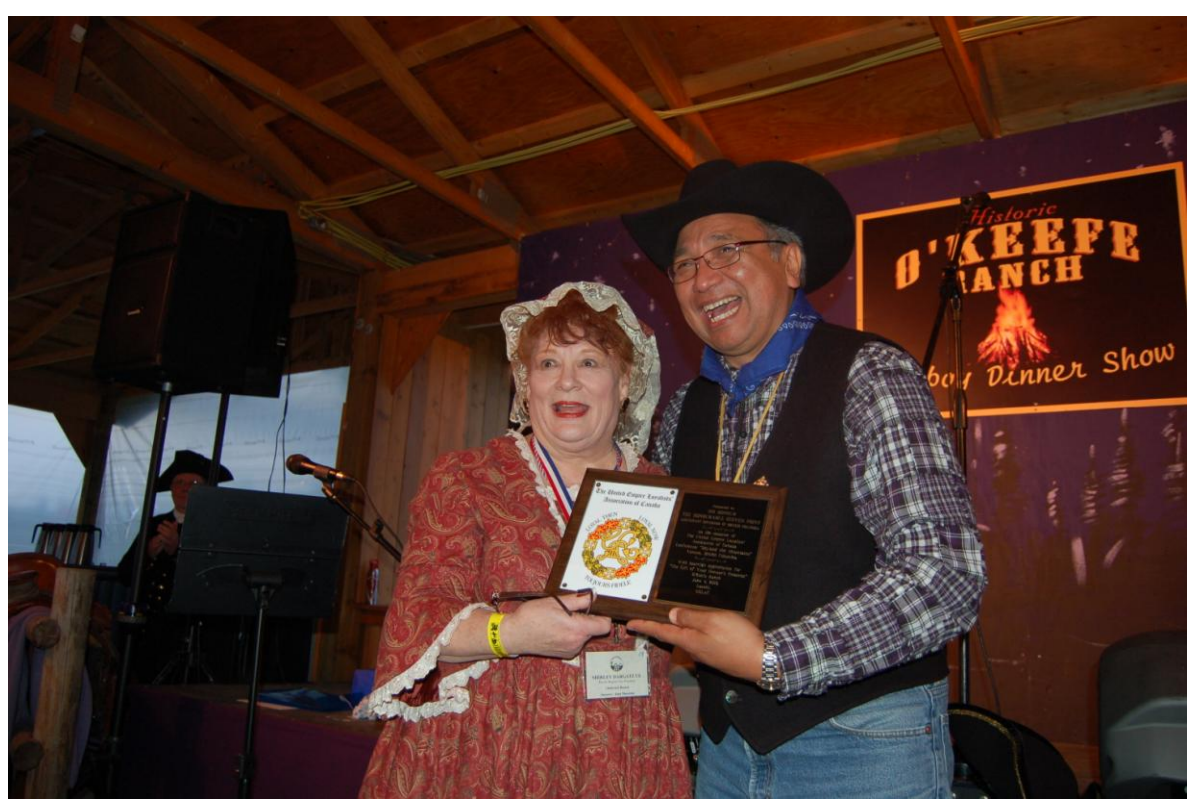
Shirley's student from Sardis did very well indeed