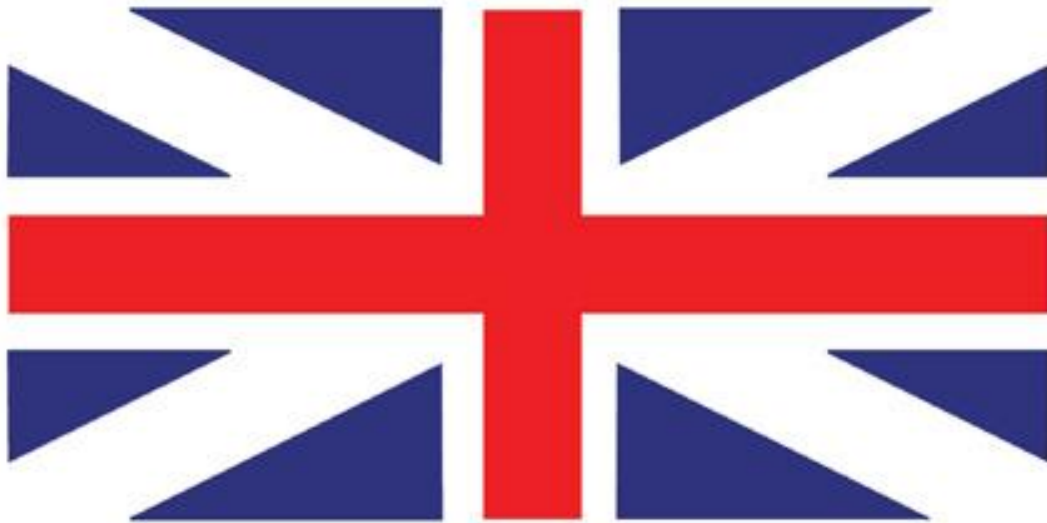
The First Union Flag, now recognized as a symbol of the United Empire Loyalists

The Union Jack is flown in Canada today as the national flag of the United Kingdom and as a symbol of Canada's membership in the Commonwealth and her allegiance to Queen Elizabeth II, the Queen of Canada. It is flown during Royal visits, for example, and is flown, along with Canada's national flag, on such occasions as the official observance of Her Majesty the Queen's birthday (the Monday preceding May 25).