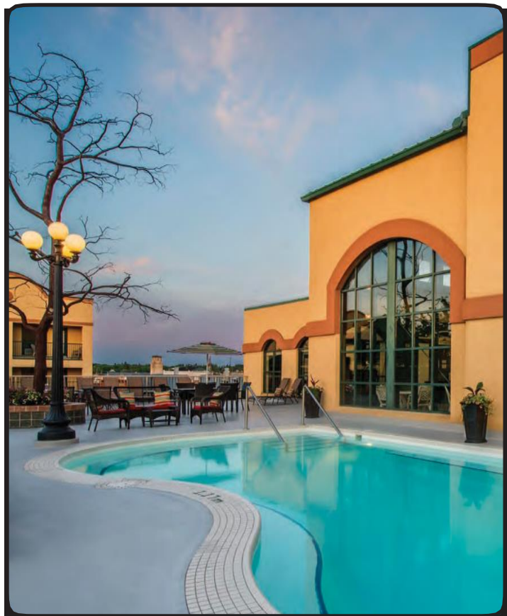
Temple Gardens Hotel has a large indoor geothermal pool with soothing mineral waters. The hotel also has this inviting outdoor pool.