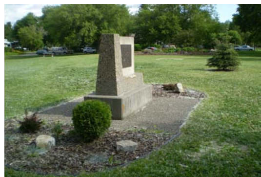
Cairn and marker located near Prince George, B.C.