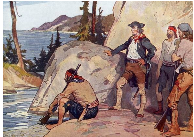
Mackenzie Reaches the Pacific 1793, C.W. Jefferys

On July 21, 1793, Mackenzie's journey of discovery reached its end near the present-day village of Bella Coola , where they spent several days exploring the various inlets and channels. Here, the plentiful First Nations peoples told them stories of their earlier encounters with white men, and not all of them were pleasant.