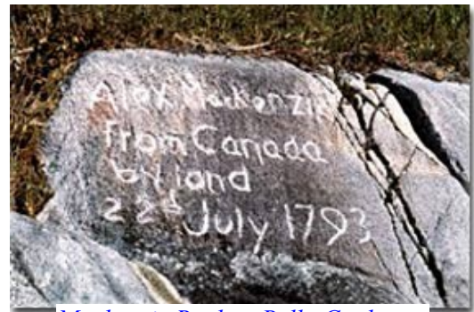
Mackenzie Rock at Bella Coola

At his destination, Mackenzie took remarkably accurate* navigational readings and on a rock overlooking the wide inlet used vermillion paint to write the famous words: "Alexander Mackenzie, from Canada, by land, the twenty-second of July, one thousand seven hundred and twenty three."