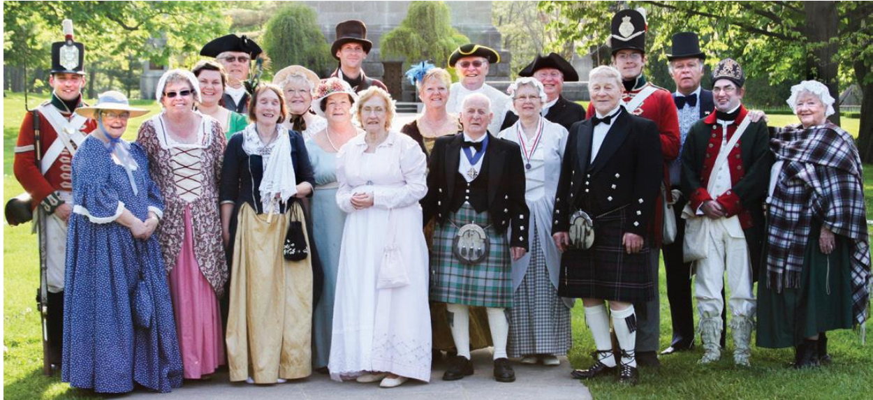
Following the Gala 2014