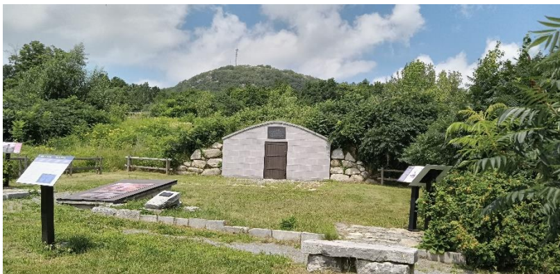
Sir John Johnson Burial Vault