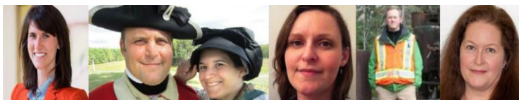
Some UELAC Scholarship Recipients

The UELAC Loyalist Scholarship is available to Masters and PhD students who are undertaking a program in relevant research. The topic should further Canada's understanding of the Loyalists and our appreciation of their, or their immediate descendants, influence on Canada.