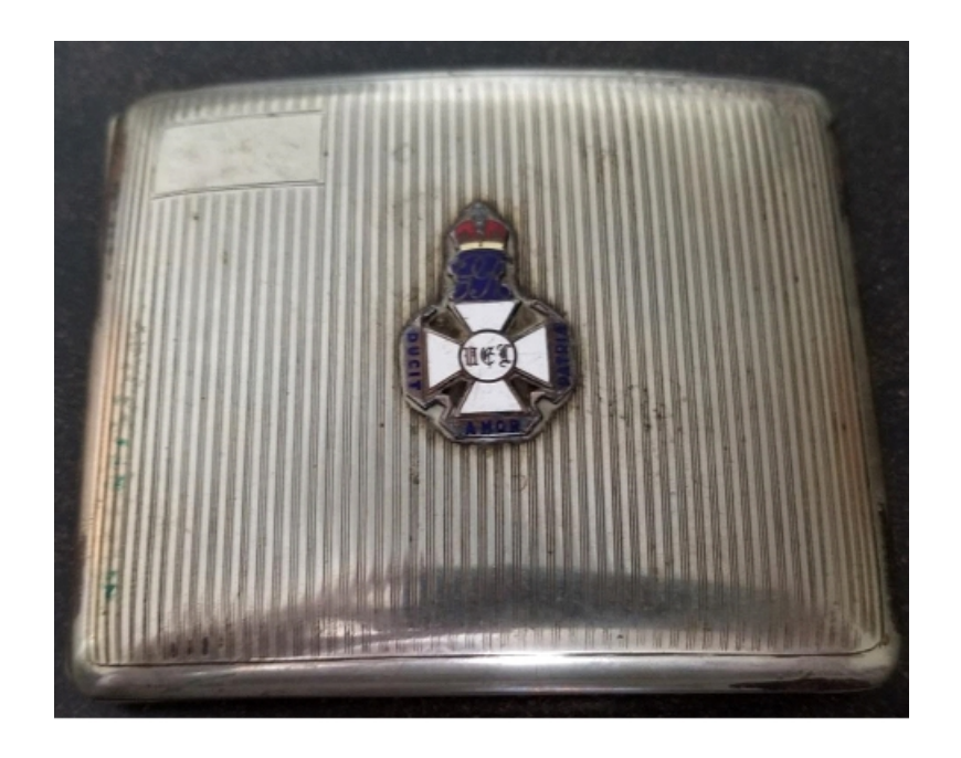
Antique silver cigarette case measures 4" x 3 ½" x ½ "

It could be the only one of its' kind or it might be one of several that were made as part of a promotional effort by a Branch of the United Empire Loyalists' Association in the 1930's but no matter what the cigarette case with the old insignia or Decoration of the UELAC on it that I recently acquired is unique. How and when it was made make it a rare Loyalist case.