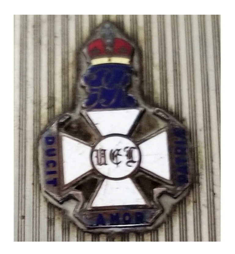
Deco ration on top of cigarette case