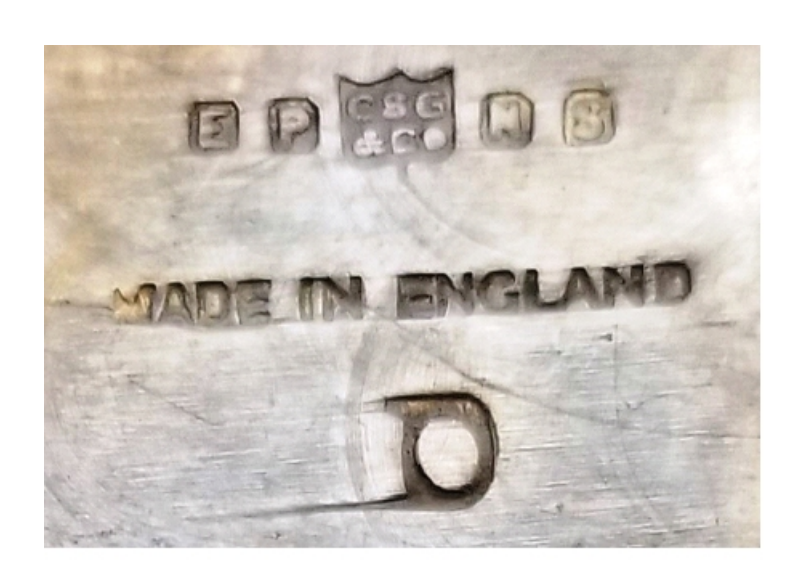
On inside of cigarette case are Hallmarks