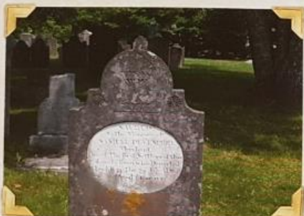
Deborah Trask UE photo