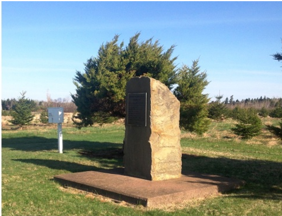
Cairn to Westchester Loyalists