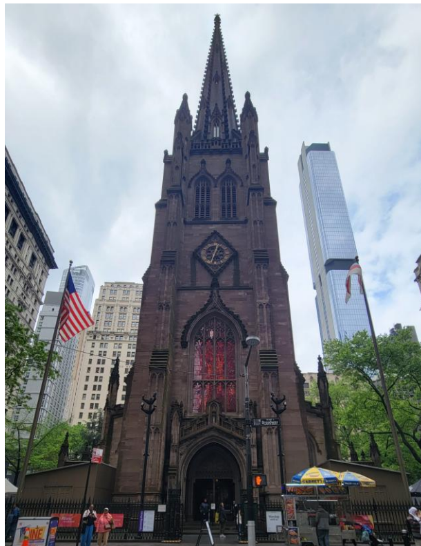
Trinity Church at 89 Broadway, New York City