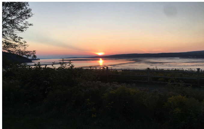
Sunset at Bay of Fundy as taken from Five Island Provincial Park, NS.