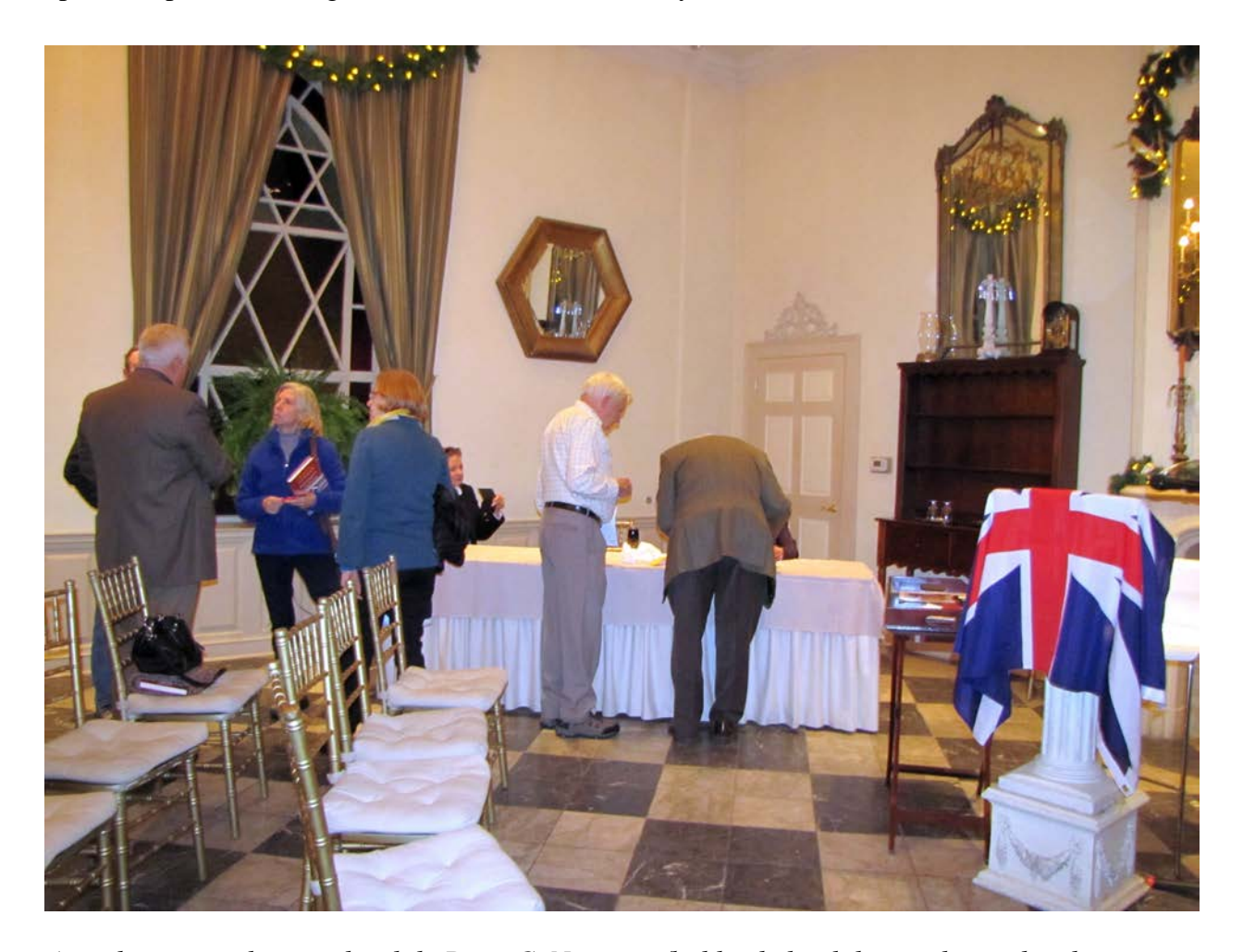
Attendees queued patiently while Peter C. Newman (hidden behind the gentleman bending over the table) signed every book as requested.

Attendees were able to purchase copies of the book on-site, thanks to Novel Idea book shop. Peter C. Newman graciously signed copies for all who wished, including one person who picked up four copies that will go under Christmas trees this year!