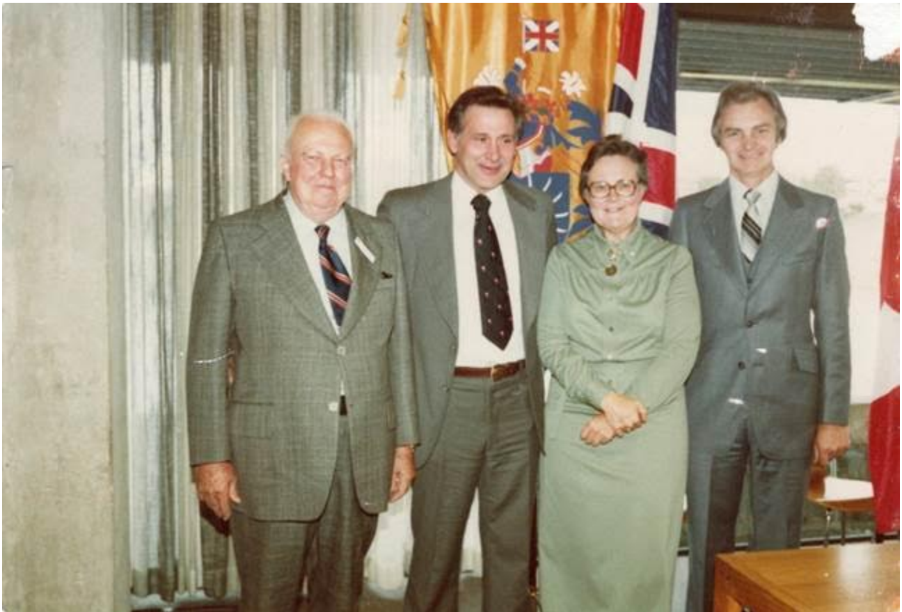
Kawartha Branch UELAC First Executive