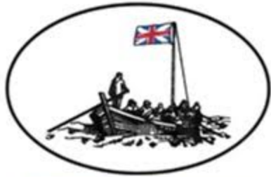
Kawartha Branch UELAC